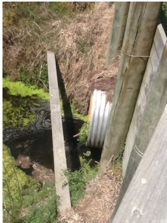
Figure 1 - Outlet (December 2019)

This is a private culvert on a tributary of the lower Rangitaiki River. The culvert is located approximately 12 km from the coast, with a diameter of 800mm, and is perched by 800mm with an undercut of 480mm. The culvert was identified as likely causing a barrier to fish migration. (Figure 1.).