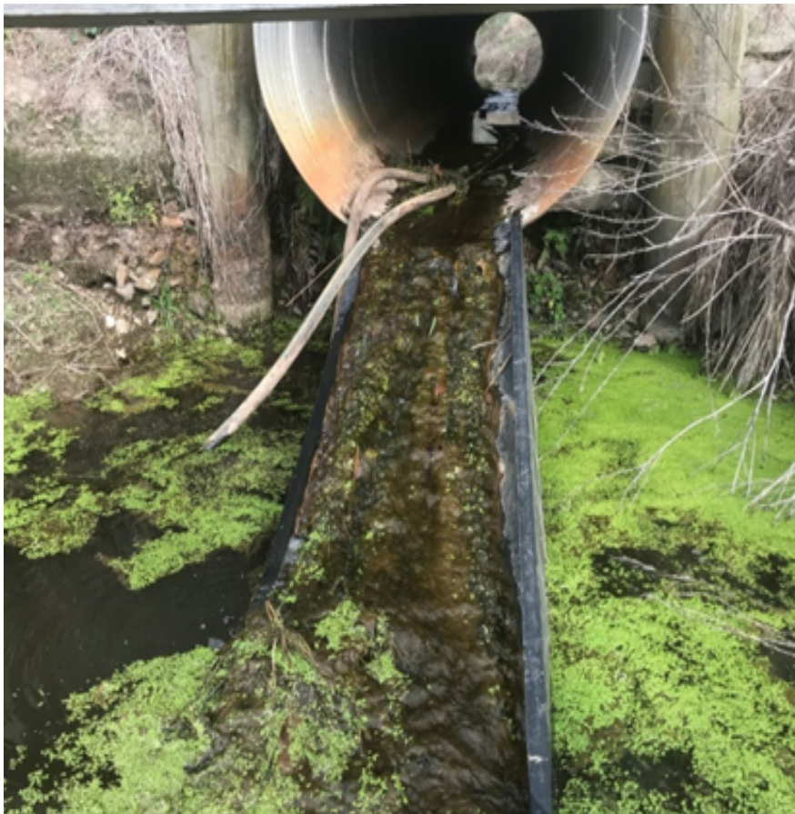
Figure 2 - Outlet (March 2020)

Note: 4 x 100mm, x 600mm flexible baffles were fitted into the culvert to improve fish passage. These were important to increase depth and to create complex flows with low velocity zones but are beyond the scope of this particular study.